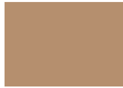
FIESTA CC320 (B)