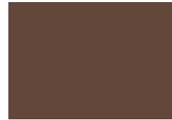
AUTUMN BROWN CC050 (D)