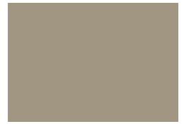
AUSTIN BUFF CC047 (A)